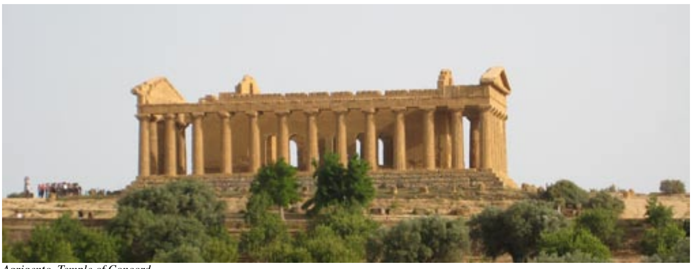
Agrigento, Temple of Concord

Island nations are special and unique places. In the company of Sicily we think of Ceylon, Formosa, Cyprus and Cuba, all places where the genus loci is unusually distinct and where the cultural and historical layers are unusually rich and vivid. Sicily, like many of these other examples, also had the good fortune to find itself at the center of the known world during much of its history. Trade routes