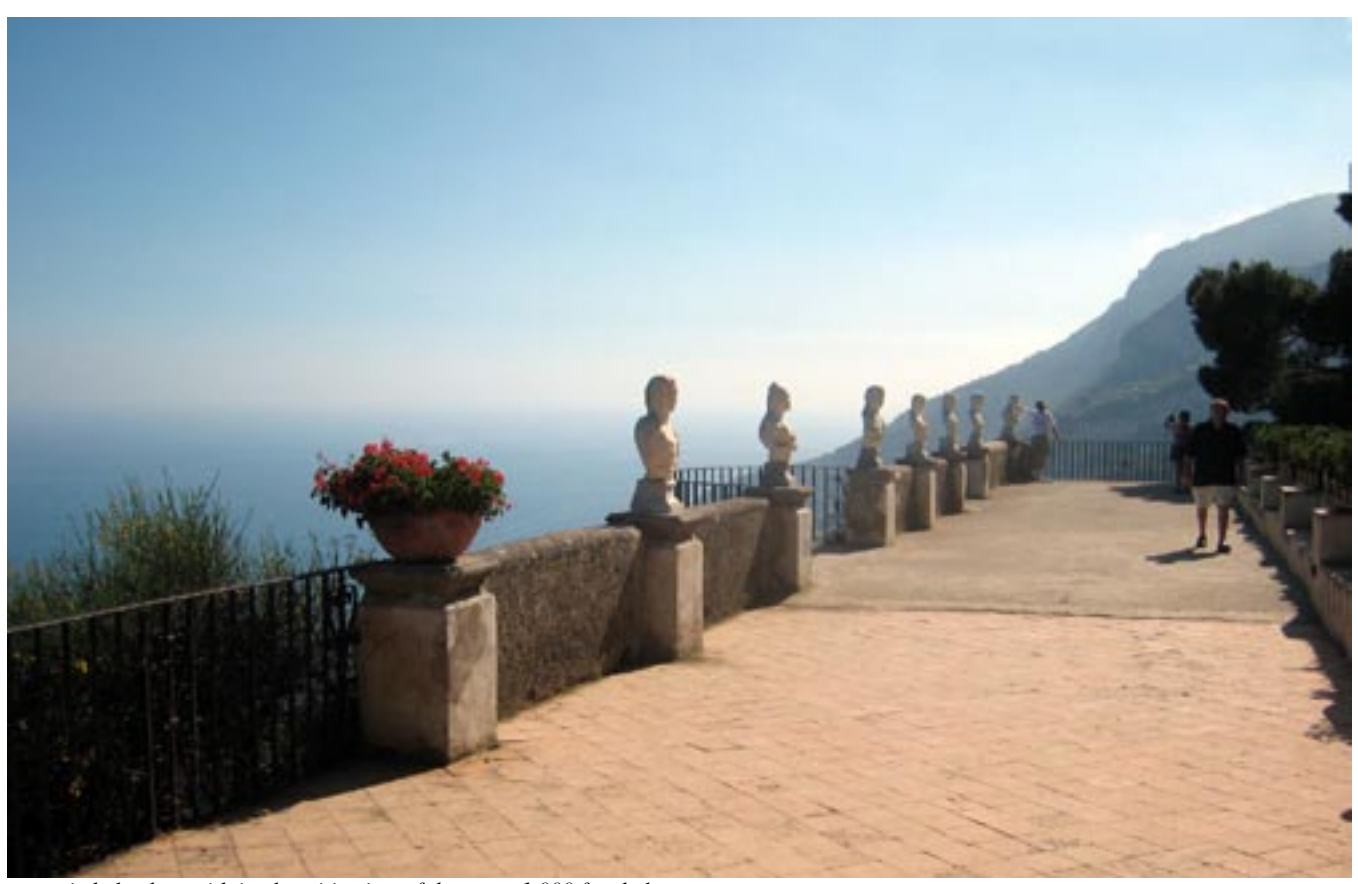
...scenic belvedere with its dramitic view of the coast 1,000 feet below.

Individual or group transfers will be arranged to the Naples Capodichino airport from which connections will be possible to the major international gateways.