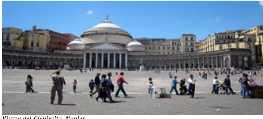
Piazza del Plebiscito, Naples

Our proposed five nights includes one at sea enroute from Catania to Naples, two nights in the heart of Naples and two nights down on the Amalfi coast-one by the sae in Amalfi and the other up in Ravello. We will experience the richness of the city along with the nearby sites of Pompei, and Paestum as well as the baroque palace of the Bourbon kings, Caserta. Ravello enjoys one of the most spectacular settings on earth, perched