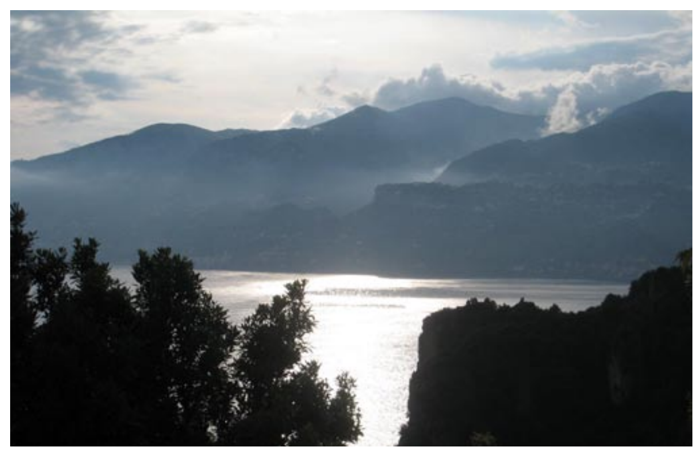
This is the first view of Ravello we will have as we drive up the coast from Salerno. (It is the flat plateau shrouded in mist)

we will stop at the imcomparable Santa Caterina Hotel, which descends from the coastal road down the cliff to the sea. Dinner will be at the hotel.