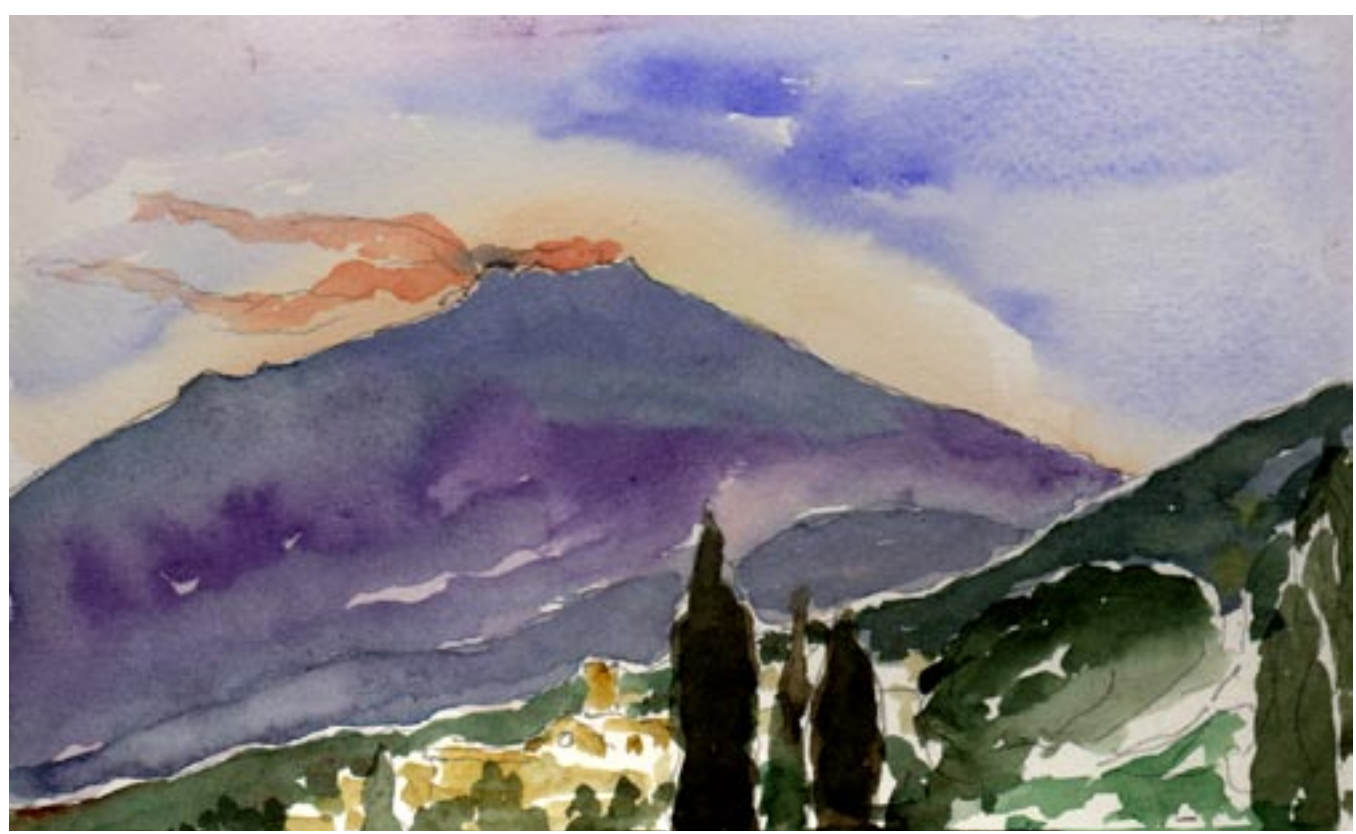
Mt. Etna from the terrace of the hotel Timeo

Individual or group transfers will be arranged to the airport at Catania for flights home. Buon viaggio e ben'tornato!