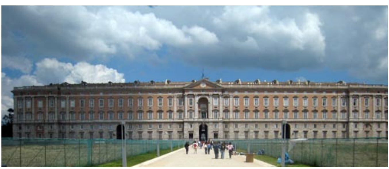
The Regia at Caserta

Descending the hill again, we will delve into Renaissance, Baroque and neoclassical Naples, studying the grouping of Castel Nuovo, Palazzo Reale, Piazza del Plebiscito (where a replica of the Pantheon is framed by a version of Bernini's St. Peters Colonnade), Teatro