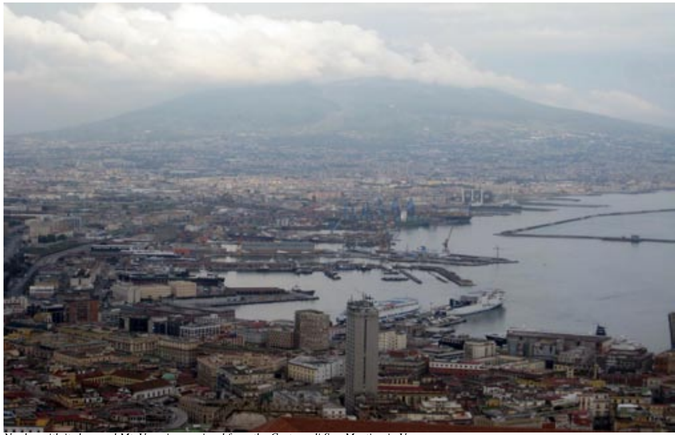
Naples with its bay and Mt. Vesuvius as viewd from the Certosa di San Martino in Vomero

After a leisurely breakfast and morning at the hotel, we will check out and depart for a circumnavigation of Mt. Etna with a stop mid-way for lunch at the town of Bronte, which is renowned for its pistachios.