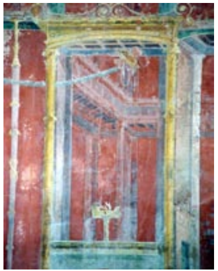
Wall paitning from Pompeii

Today we will ascend one of the funicular lifts to the elegant 19th century Vomero neighborhood and the Certosa di San Martino, a former monastery set in a commanding position over the city. From there we will acheive a sense of