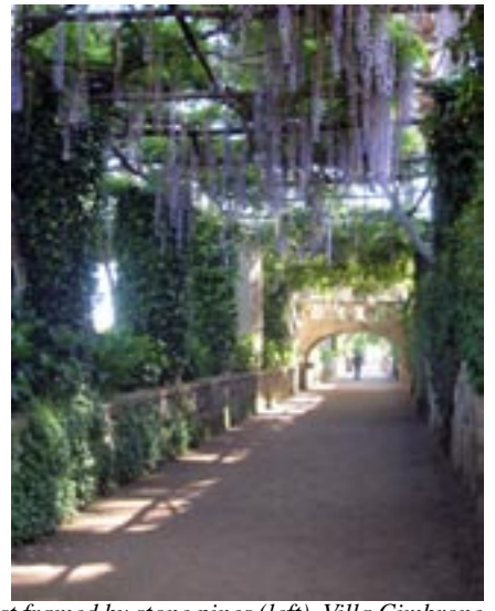
Ravello's town square with views down the coast framed by stone pines (left), Villa Cimbrone at Ravello. The axial path with its wisteria clad arbor leads to the...