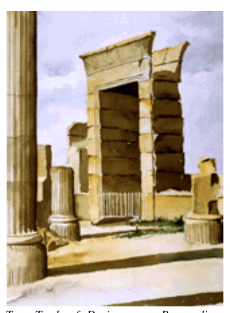
Top: Tomb of Darius, near Persepolis Above: Persepolis

Full day excursion to Persepolis, one of the most important sites of the Ancient World, the ceremonial capital of the Achaemenid kings with remains of the palaces of Darius the Great, Xerxes and Artaxerxes, and its famous bas-reliefs, depicting kings and courtiers and giftbearing representatives of tributary nations of the Persian Empire; also visit Naghsh-e-Rostam to see Ka'be-Zardosht (fire temple/sanctuary), and Royal Tombs (also Achaemenid); plus seven magnificent Sassanian rock-reliefs (including Shapur the First's famous victory over Roman Emperor Valerian); and Naghsh-e-Rajab, a nearby grotto with several more Sassanian reliefs; return to Shiraz.