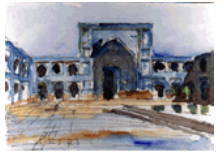
Both images: Isfahan, Shah Mosque

of Nightingales. The small but intricate building is set amongst tree-lined alleys, a reflecting pool and water rills.