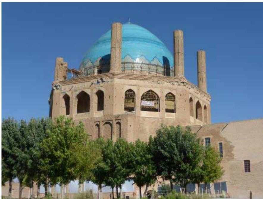
Above: 14th century Gonbad-e-Soltaniyeh (Soltaniyeh Dome) near Zanjan; Below: Arg, or Citadel, of Rayen

age of 83 his mausoleum has become the Mecca of thousands of pilgrims every year; nearby, the attractively brick-vaulted Mirza Ali Akbar Mosque has a blue Kufic-tiled exterior frieze. The Mongol Il-khanid Jame Mosque was once a truly gigantic brick edifice but little remains now; time-permitting visit the attractive covered bazaar of Ardabil; overnight stay at hotel.