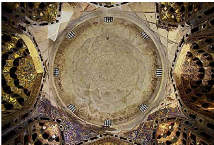
Above and right top: Mausoleum of Sheikh Safi-eddin Ardebili; Below, left: Arg-e Alishah, 14th century; and Below, right: Mirza Ali Akbar Mosque.

Arrival in Tabriz in the early hours of the morning; meet and transfer to hotel (with our room waiting for us, prebooked for May 5); after some rest, visit the Blue Mosque, known in the world as the Turquoise of Islam, and the Azerbaijan Museum, displaying a fine collection of pre-historic and historic artifacts in the area; also visit the Grand Bazaar of Tabriz (a UNESCO World Heritage Site); overnight stay at hotel.