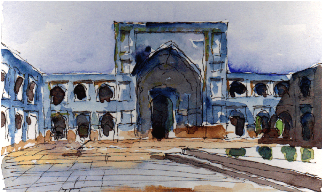
Top right: Isfahan, Friday Mosque; Top left and above: Isfahan, Shah Mosque

Full day tour of the beautiful city of Isfahan, the 17th century capital of the Safavids, referred to as Nesf-e-Jahan (Half of the World) in Safavid sources, to visit the famous bridges of Shahrestan, Khajou, and Sio-se-pol, the Armenian Quarter with several churches, including the important