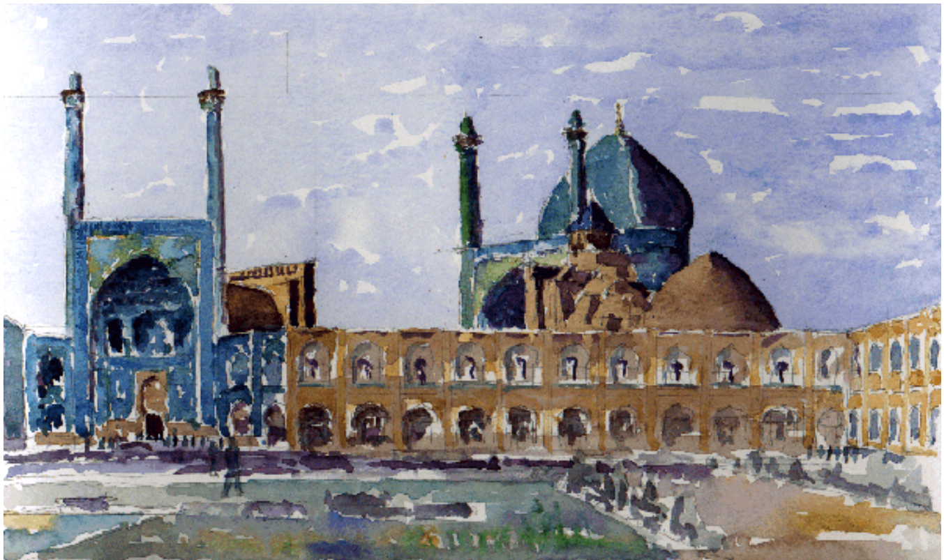
Isfahan: Shah Mosque viewed from the Maidan

M odern Iran is a place that has been much in the news lately. There is far more to the experience of this complex country than the news of the past four decades and its most recent re-entry on the world stage would indicate. Fundamentally, a visit there astounds and delights for the warm degree of welcome and hospitality that awaits the visitor from the west, and particularly from the United States. Just as experiencing this country today is enlightening and informative, an immersion in traditional Persian culture of the past offers the key to understanding the winds of cultural change and innovation that have swept through this pivotal bridge between the east and the west.