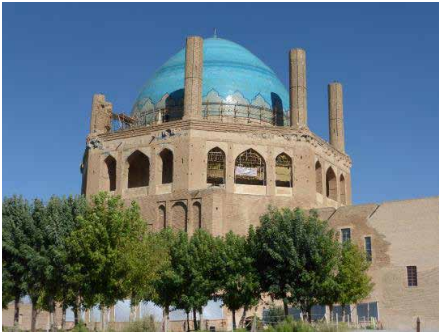
Above: 14th century Gonbad-e-Soltaniyeh (Soltaniyeh Dome) near Zanjan; Below: Arg, or Citadel, of Rayen

made Ardebil his home. He was the forefather of the well-known Safavid kings of Iran, and since his death at the age of 83 his mausoleum has become the Mecca of thousands of pilgrims every year; nearby, the attractively brick-vaulted Mirza Ali Akbar Mosque has a blue Kufic-tiled exterior frieze. The Mongol Il-khanid Jame Mosque was once a truly gigantic brick edifice but little remains now; time-permitting visit the attractive covered bazaar of Ardabil; overnight stay at hotel.