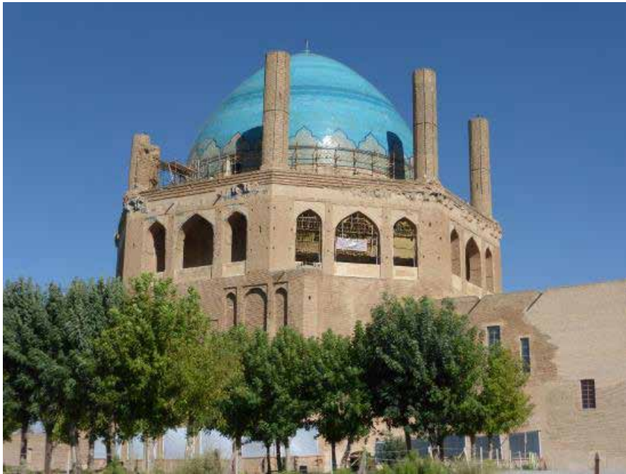
Above: 14th century Gonbad-e-Soltaniyeh (Soltaniyeh Dome) near Zanjan; Below: Arg, or Citadel, of Rayen

made Ardebil his home. He was the forefather of the well-known Safavid kings of Iran, and since his death at the age of 83 his mausoleum has become the Mecca of thousands of pilgrims every year; nearby, the attractively brick-vaulted Mirza Ali Akbar Mosque has a blue Kufic-tiled exterior frieze. The Mongol Il-khanid Jame Mosque was once a truly gigantic brick edifice but little remains now; time-permitting visit the attractive covered bazaar of Ardabil; overnight stay at hotel.