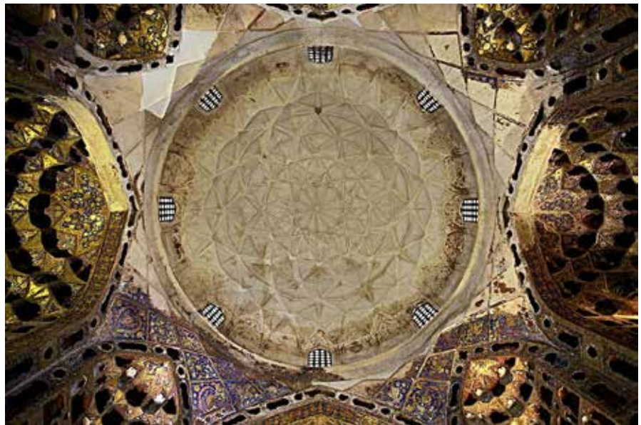
Above and right top: Mausoleum of Sheikh Safi-eddin Ardebili; Below, left: Arg-e Alishah, 14th century; and Below, right: Mirza Ali Akbar Mosque.

Arrival in Tabriz in the early hours of the morning; meet and transfer to hotel (with our room waiting for us, prebooked for April 17); after some rest, visit the Blue Mosque, known in the world as the Turquoise of Islam, and the Azerbaijan Museum, displaying a fine collection of pre-historic and historic artifacts in the area; also visit the Grand Bazaar of Tabriz (a UNESCO World Heritage Site); overnight stay at hotel.