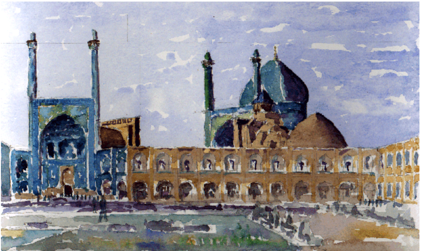
Isfahan: Shah Mosque viewed from the Maidan

M odern Iran is a place that has been much in the news lately. There is far more to the experience of this complex country than the the news of the past four decades and its most recent re-entry on the world stage would indicate. Fundamentaly, a visit there astonsihes and delights for the warm degree of welcome and hospitality that awaits the visitor from the west, and particularly from the United States. Just as experiencing this country today is enlightening and informative, an immersion in traditional Persian culture of the past offers the key to understanding the winds of cultural change and innovation that have swept through this pivotal bridge between the east and the west.