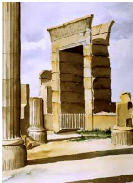
Top: Tomb of Darius, near Persepolis; Above: Persepolis

Morning drive to Shiraz with en route visit to Pasargadae (UNESCO World Heritage Site), pre-dating Persepolis, the first dynastic capital of the Achaemenian Empire, founded by Cyrus the Great in the sixth century B.C, to see the simple but impressive tomb of Cyrus, and the remains of his palaces, all located in the vast plain of Dasht-e-Morghab; continue to Shiraz for overnight stay at hotel.