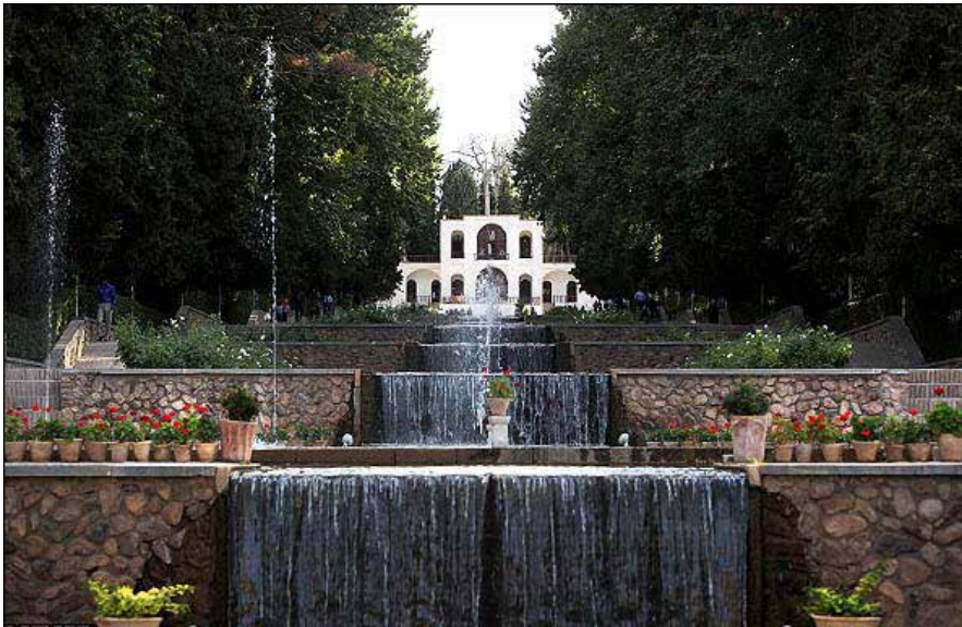
Above: Mahan, Shahzadeh Garden, a late 19th century Qajar period garden and house; Below: Zoroastrian Towers of Silence (called a Dakhma, a wide tower with a platform open to the sky), dating back to the 18th century; and Below left, one of the domed chambers in the complex.