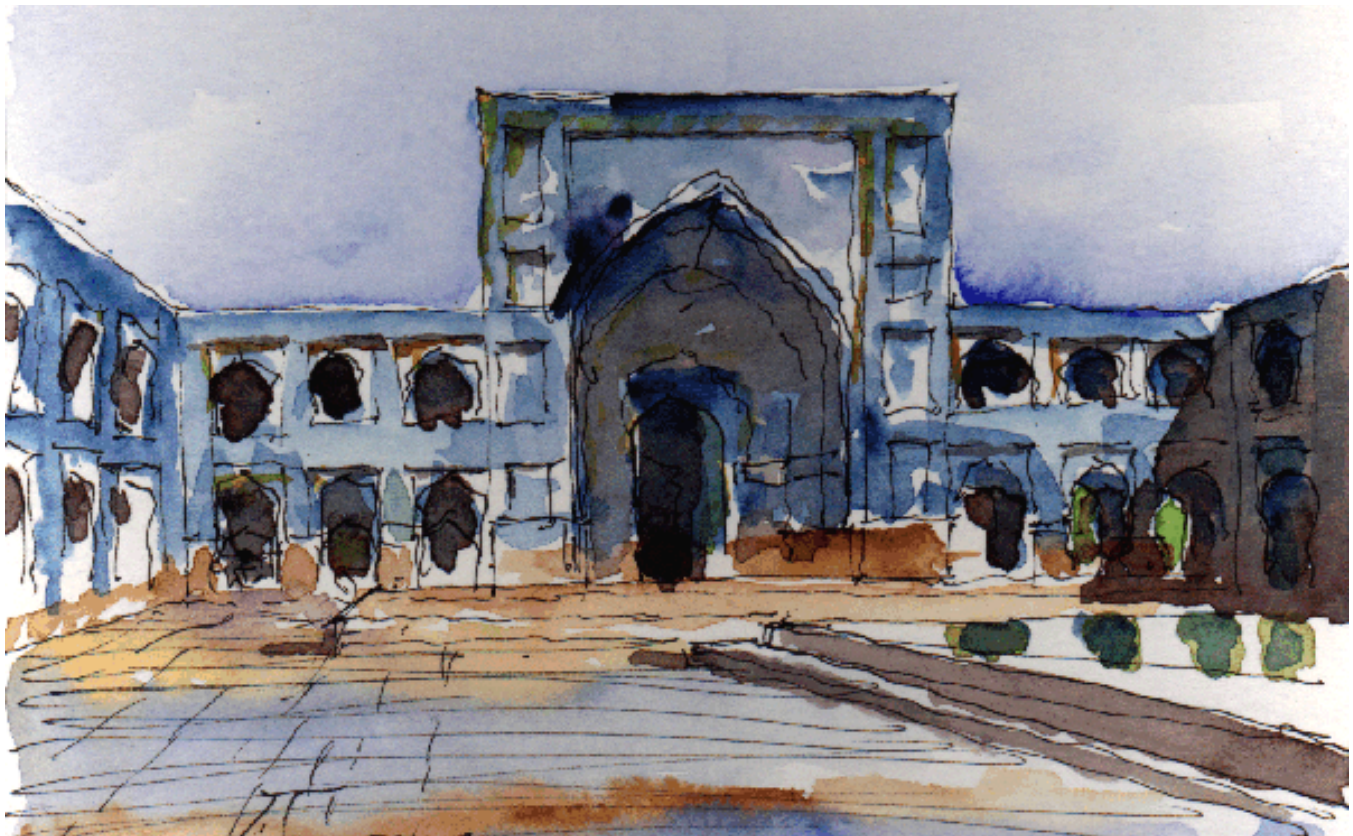
Top right: Isfahan, Friday Mosque; Top left and below: Isfahan, Shah Mosque

clergy in Iran; on to Na'in, another charming desert town, half way between Yazd and Isfahan, to visit the 10 th century Friday Mosque, and the 17 th century Pirnia House/ Ethnographic Museum, with a walk through the old part of town; overnight stay at Abbasi Hotel.